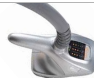
Used for large areas such as the thighs, buttocks or abdomen