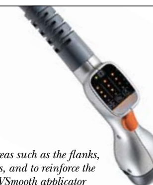
Used for small areas such as the flanks, calves and arms, and to reinforce the results of the VSmooth applicator